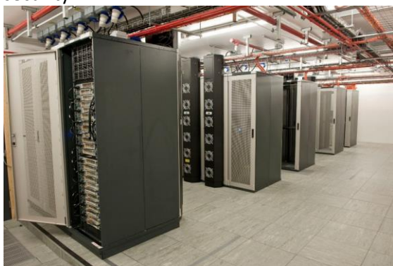
Figure 1 - Equipment racks in NBI's main data centre hall

A data centre is typically a room or even an entire building containing a significant number of computer systems for data processing and storage. By concentrating equipment in this way it not only frees up valuable space in the laboratory, but also makes financial sense as there are economies of scale to be made in management, maintenance, energy and security.